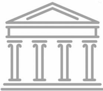
The Netherlee and Stamperland Forum